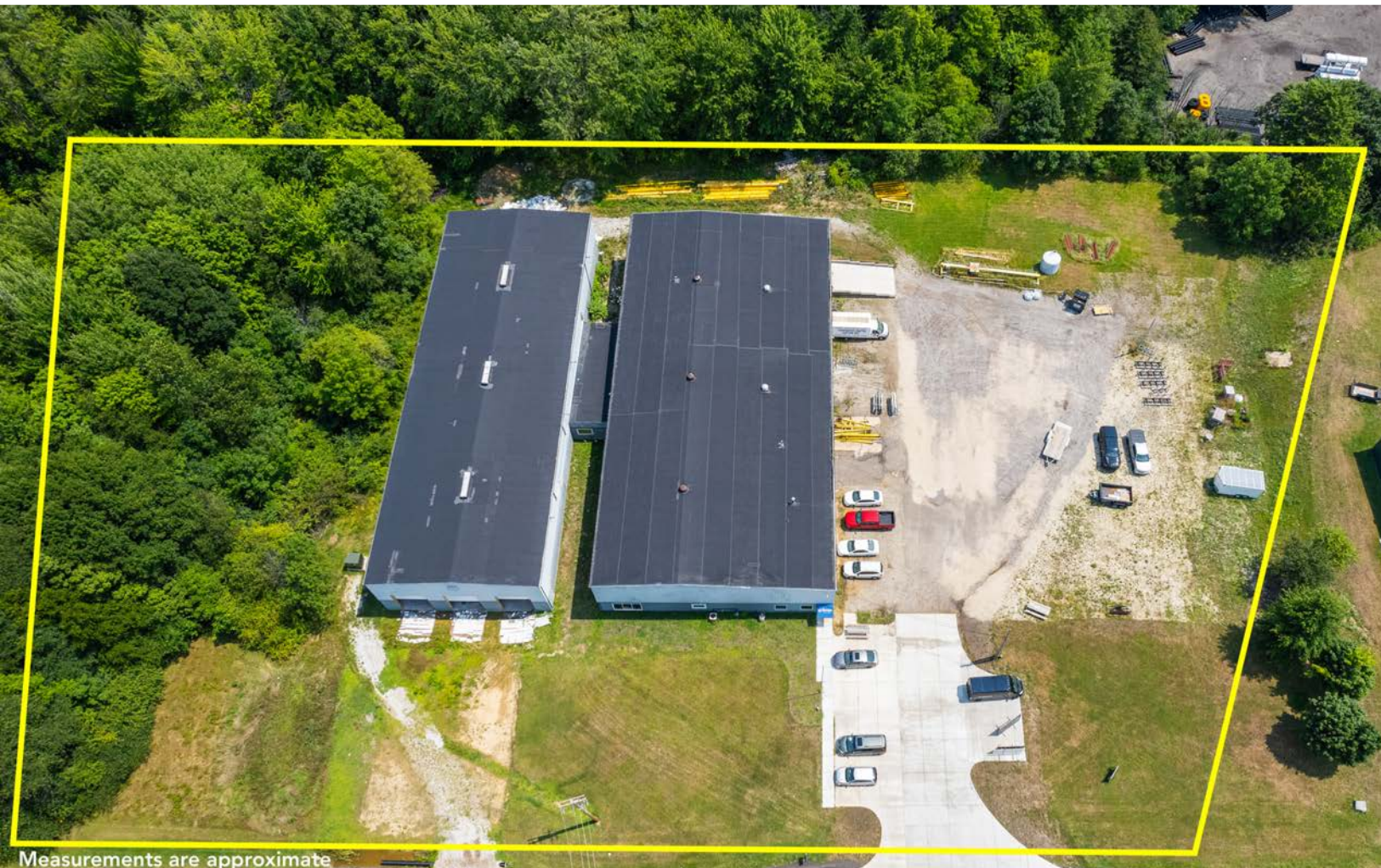
Measurements are approximate